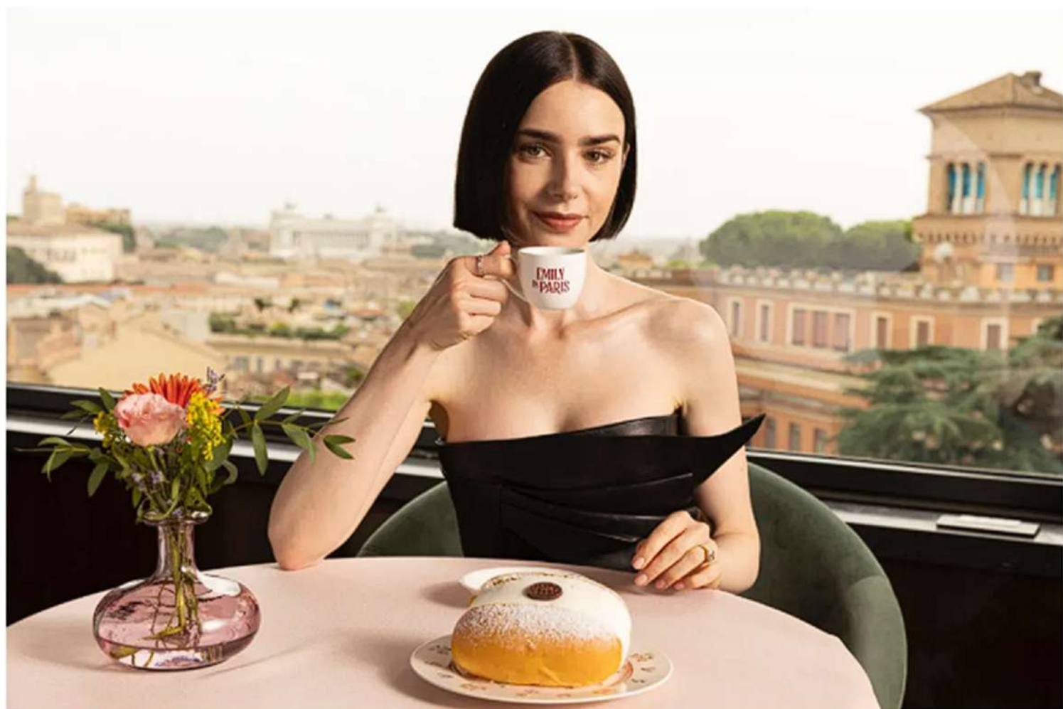
Emily in Paris, in Rome for season 5